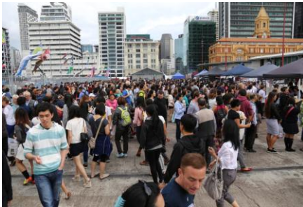
One of Auckland's major event