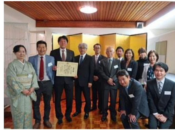
Members at the Commendation ceremony