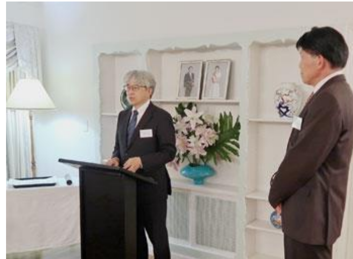
Consul General Hamada